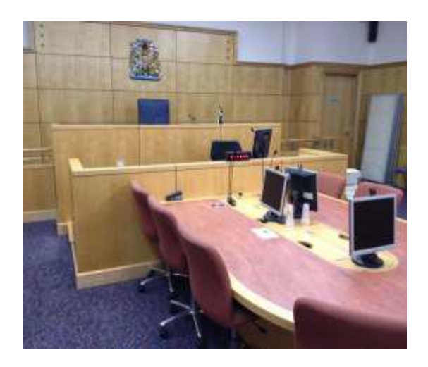
Typical court room