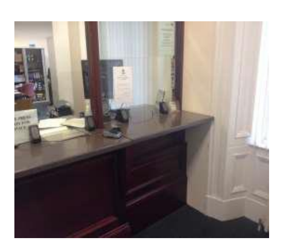
Fines and Criminal Office

The reception desk is provided with a dropped counter and a fixed induction loop system.